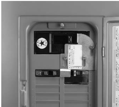
Cutaway showing installed Generator Interlock Kit (above)